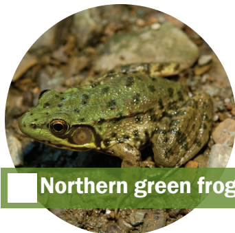
Northern green frog

Rainbow darters are small fish found in streams with gravel bottoms. Males are a brilliant blue and orange while females are drab in color. They average 1.5" to 2.5" in length.