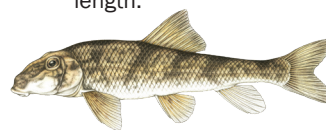
Northern hog sucker

Stonecat madtoms are small members of the catfish family averaging 4" to 8" in length. They prefer large faster-moving streams with large boulders.