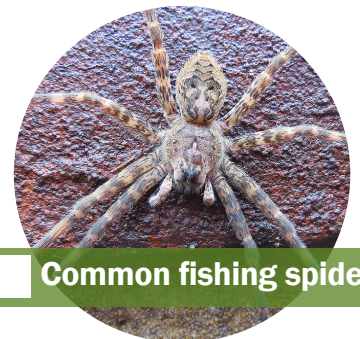
Common fishing spider

Ebony jewelwings are beautiful damselflies with black wings and metallic blue-green bodies. These delicate insects are often seen on small streams.