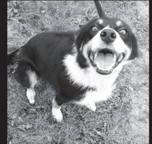
Lake Metroparks Farmpark's BORDER COLLIE

Great ways to get involved with the Farmpark