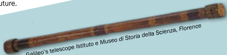
Galileo's telescope Istituto e Museo di Storia della Scienza, Florence

Come and make your own telescope at Telescope 101 . Make a star chart and connect the dots of the past. Enjoy a different astronomical feature each month at Astronomy Night . Discover the night sky with thousands of others as we count how many stars we can see at night during the Great World Wide Star Count and GLOBE at Night . Super Star Party will celebrate the life and times of Galileo and all of his contributions to the science of astronomy. Explore the sun and the moon and understand how ancient peoples used the night sky. Consult pages 7, 26 and 27, and look in future issues of Parks Plus! for details about these programs and more.