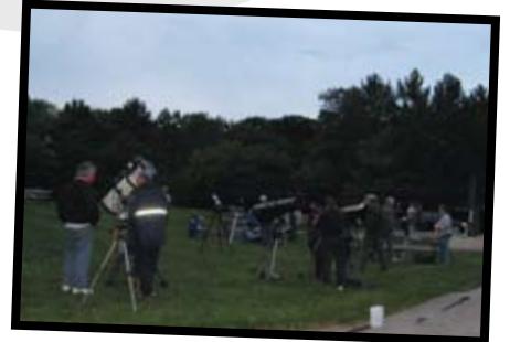
at Super Star Party

With their help, Lake Metroparks has been able to offer many programs that have the added bonus of telescopes! Monthly astronomy nights are a time to find Jupiter's moons or Saturn's rings as well as truly awe-inspiring galaxies and stars! The Super Star Party on August 14 at 8 p.m. at Penitentiary Glen, would not be the same without the help of CVAS. Ten to 15 telescopes explore the night sky as the public gets an up-close and personal look at what the universe has to offer! Many thanks go out to CVAS and all of the volunteer hours they put into helping out Lake Metroparks. For more information, visit chagrinvalleyastronomy.org .