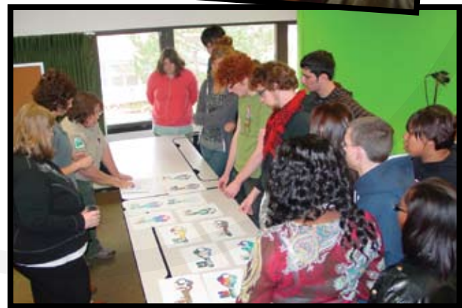
Lake Metroparks staff members meet with seniors from Mayfield Excel TECC to discuss and offer feedback on their holiday key designs.