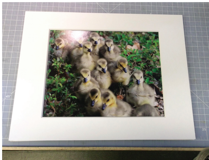
4. Fold the mat down to frame the photo.