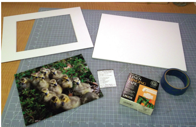
1. Basic supplies: white pre-cut mat, backing board (cardboard or other), photo, photo label, assorted tape.