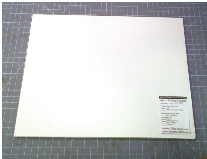
5. Flip matted photo over and affix label to the bottom right using Scotch tape.