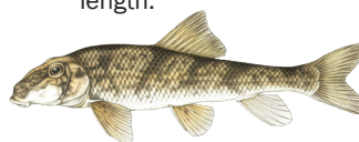
Northern hog sucker

Stonecat madtoms are small members of the catfish family averaging 4" to 8" in length. They prefer large faster-moving streams with large boulders.