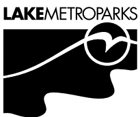
Photo Contest Entry Form

All entries must be received by 4:00 pm, Sunday, May 31, 2026. Include entry fee(s) in exact change or personal check with this form.