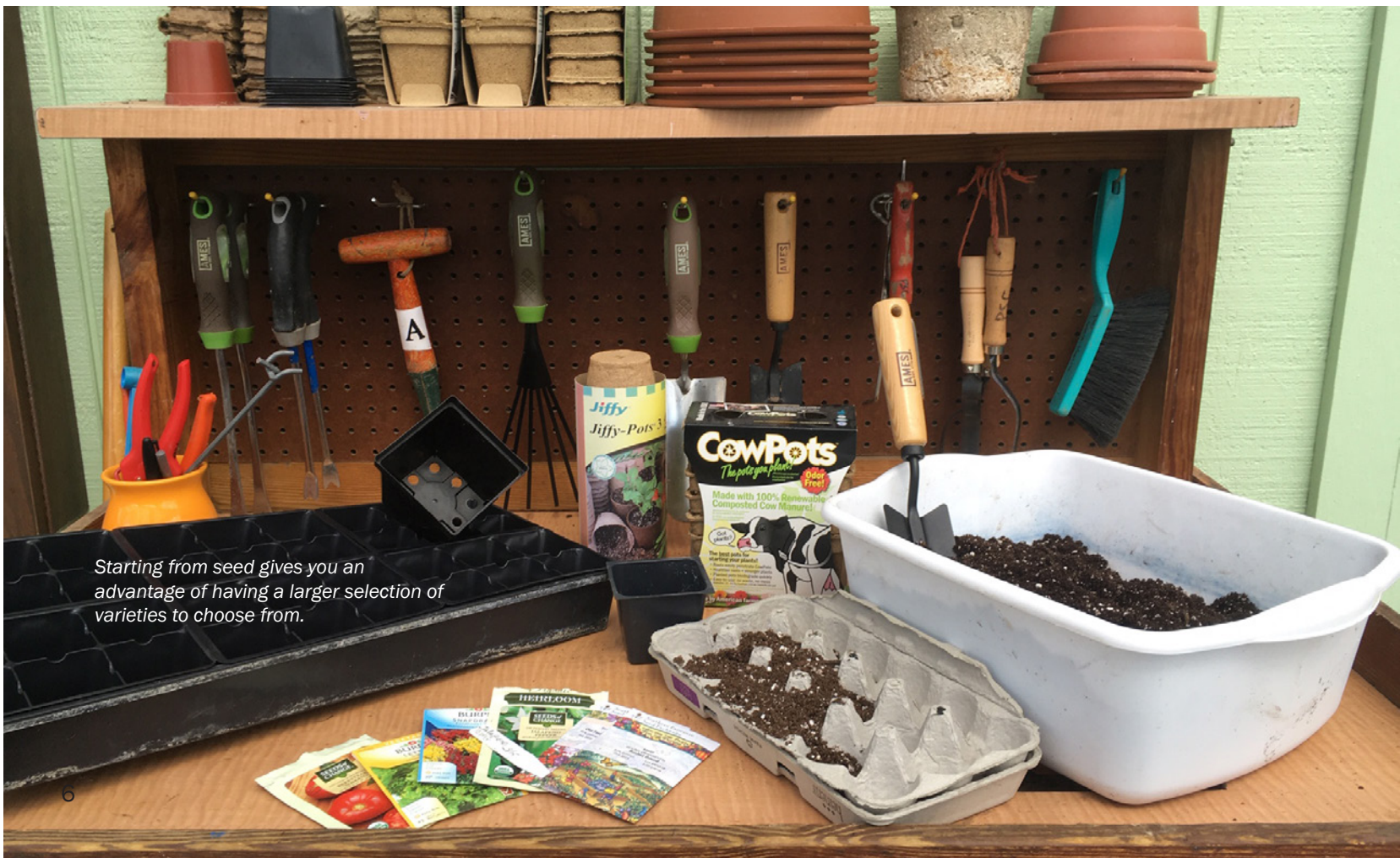
Starting from seed gives you an advantage of having a larger selection of varieties to choose from.