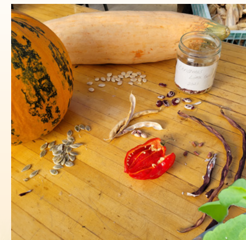
Starting from seeds allows you to choose from a variety of options you may not have if you buy plants from a garden center or nursery.