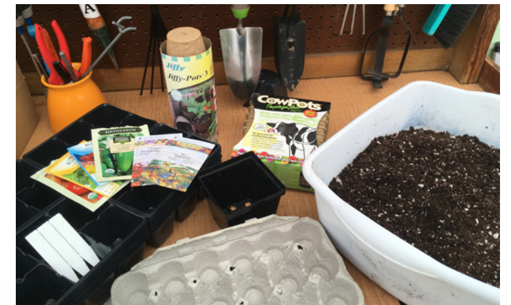
There are a variety of kits for seed starting on the market with trays and inserts or you can get by with an empty egg carton on a tray.

If you have questions about seed starting or where to find seeds, come visit the Plant Science Center at Lake Metroparks Farmpark to see what we have sprouting up. We're always happy to share garden tips with visitors.