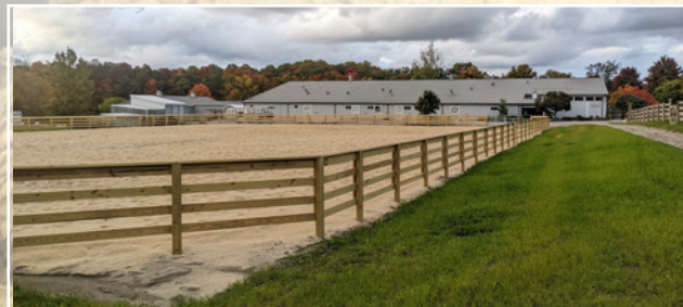
The new outdoor equine arena opened in 2022.

Check out the new event Lamb Jam at the end of April for some springtime family fun!