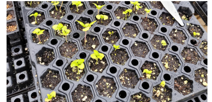
Once seeds start to germinate and get their first true leaves, you can add some diluted fertilizer when watering.

There are a variety of kits for seed starting on the market with trays and inserts or you can get by with an empty egg carton on a tray. Damping off is a common problem with seed starting and is caused by fungus. Fungus can be prevented by using sterile germinating mix and clean pots or trays. If you are reusing old pots or seed trays make sure they are disinfected. Make sure you don't over water seedlings—they should be kept moist but not soaked. A clear plastic cover can help keep them moist.